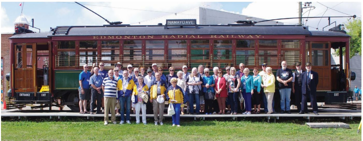
Two groups of fearless adventurers braved the top deck of Edmonton's High Level Bridge.