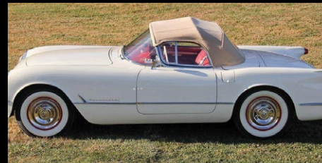
1954 CORVETTE - 99.5 NCRS RATING