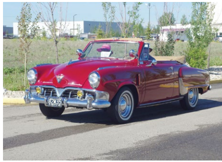
1952 Studebaker Champion ragtop took People's Choice honours for 1949 and Newer.