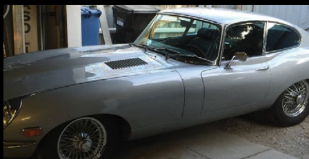
1970 JAGUAR E-TYPE FHD