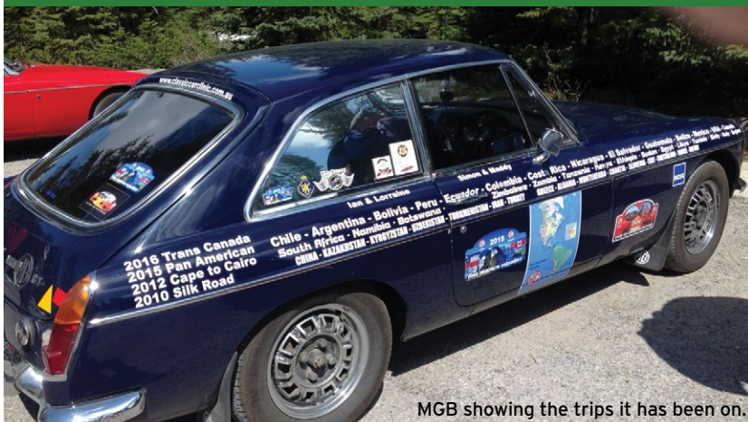
MGB showing the trips it has been on.

friends northward from South America to the end point and winter hiatus for the cars in Vancouver. Their plan was to return to Canada in May of 2016 and drive east across North America to a final destination in St. John's, Newfoundland. I knew I wanted to meet them and hear their stories and I felt confident that the Calgary MG Car Club and its members would also.