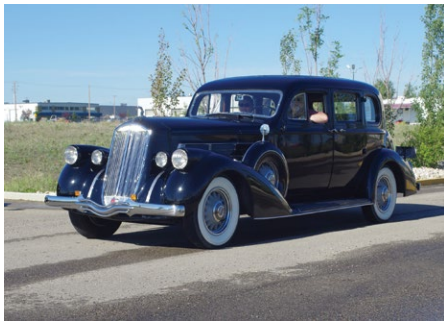
Stunning 1936 Pierce Arrow was the People's Choice for 1948 and Older.