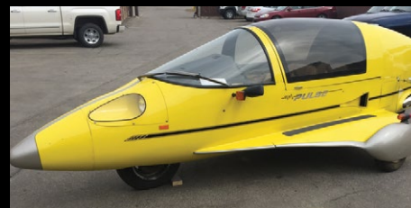
1986 OWOSO PULSE ULTRA RARE!