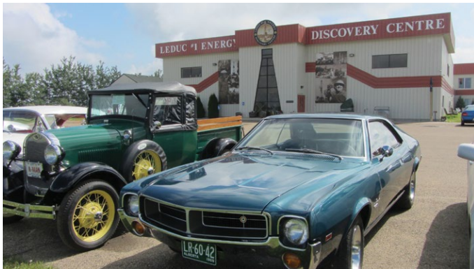
Sharp Javelin and Model A Ford outside the Leduc #1 Energy Discovery Centre.