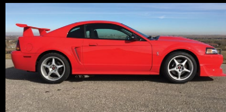
2000 MUSTANG COBRA R - 1 OF 300