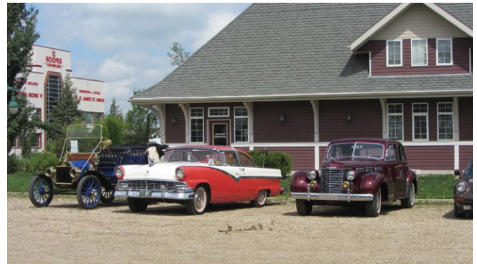
Outside the vintage train station at the Leduc West Antique Society.