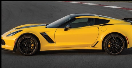
2016 CORVETTE C7R - 1 OF 50 CDN CARS!

NEW 2016 Fall Auction Vehicles Consign Yours Today!