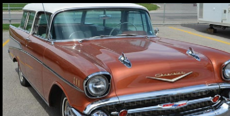
1957 CHEVY BEL AIR NOMAD - POWER PKG