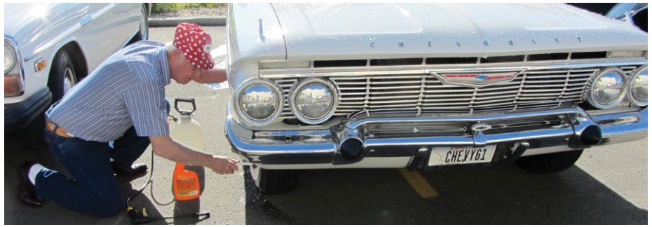
1961 Chev Impala was one of several rides that made the drive up from Montana.