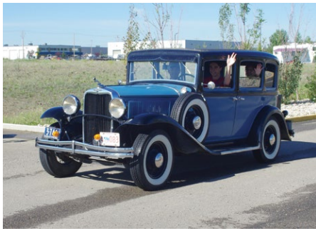
The Youngest Driver waves hello from Grandpa's 1931 Dodge sedan.