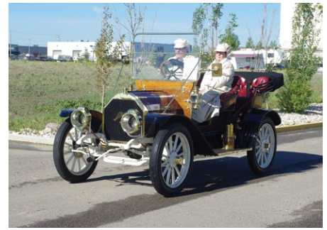
Oldest car, and as rare as they come, was this 1910 Mitchell Model R.